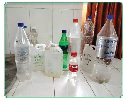
Picture 1: Various water samples received in DLL, Himatnagar for testing (25-04-2018)

NRDWP guidelines also provide that each and every source of water shall be tested for chemical parameters once in a year and twice for bacteriological parameters i.e. once during pre-monsoon period and once during post-monsoon. There are 5,78,866 reported water sources in the State as of February 2018. As per norms, at least 5,78,866 water samples should have been tested for chemical parameters and 11,57,732 water samples should have been tested for bacteriological parameters during the year 2017-18. However, Audit observed from the information furnished by GJTI that only 1,86,431 samples (32 per cent ) were tested for chemical parameters and only 1,23,771 samples (11 per cent ) were tested for bacteriological parameters during the year 2017-18. The reasons for shortfall in testing were attributed to insufficient TLLs in the State.